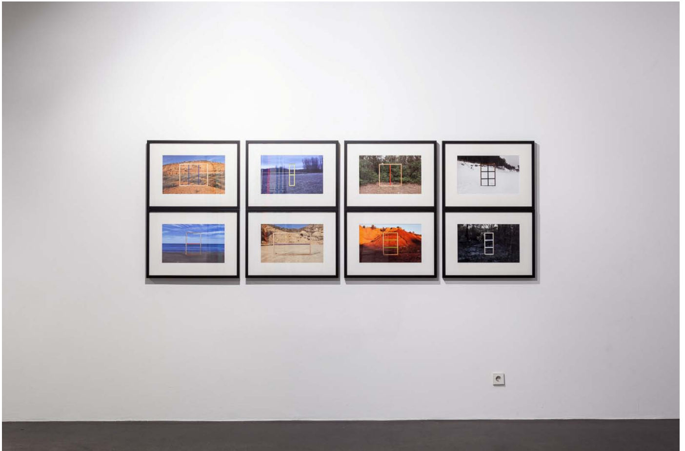
Stretchers in landscapes, Irene Grau.