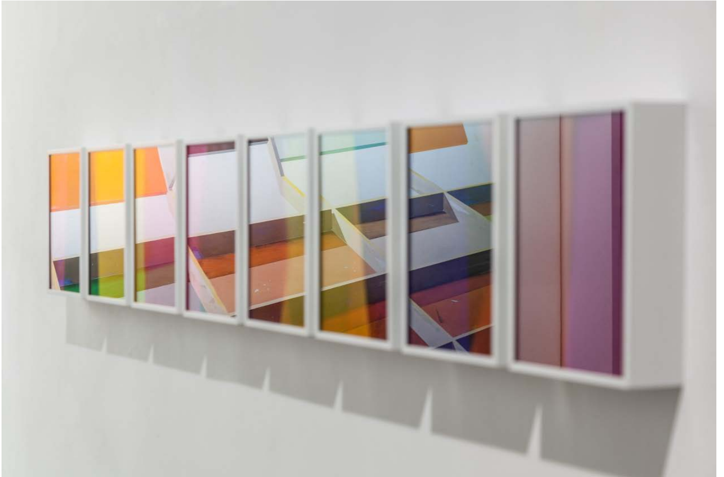
Paths of colour, Irene Grau.